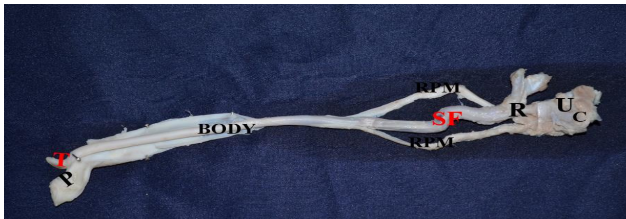
Fig. 2: Photograph showing root of the boar penis. Cr – Crura and Bulbous urethra (BU).

major part of the penis in boar and was round in the middle and flat at the tip. It formed a 'S' shaped sigmoid flexure anterior to the scrotum in the inguinal region (Fig. 1).