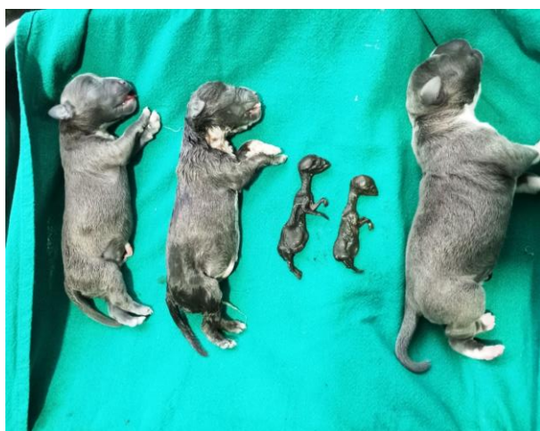
Fig. 1: Mummified fetuses with normal fetuses

The skin was sutured with silk suture using a simple interrupted pattern. In perioperative time the female dog was given isotonic fluid normal saline (NS®; Beybee Pharmacy) @ 40 ml/kg body weight, and antibiotic therapy was done with ceftriaxone and tazobactam (Intacef-Tazo®; Intas Pharmaceuticals) @ 15 mg/kg body weight at a gap of 12 hours, injection meloxicam @ 0.2 mg/kg body weight once in a day. Antiseptic dressing of the surgical wound was done with povidone-iodine (Betadine®; Win-Medicare Pvt. Ltd.) solution daily till the removal of sutures were removed after 14 days of the surgery.