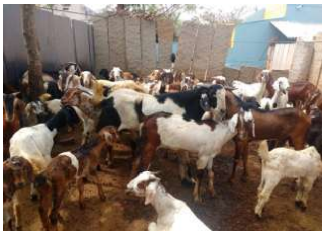
Fig. 1: Indigenous goats

Indigenous goats (Fig. 1) are medium sized animals and mostly maintained for meat purpose. Coat colour is predominantly black followed by black with white patches and brown with white patches. Head is straight and slightly convex. Ears are medium droopy and leaf like. Both the sexes have thick and small horns. Udder was fully developed and has conical shaped teats. Indigenous goats are highly prolific and an incidence of multiple births (twinning and triplets) was very common.