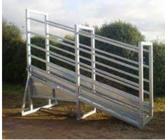
Figure 2: Ramp for loading the food animals (Reference- https://www.pinterest.com/tmnorton8283/loading-ramp/ )