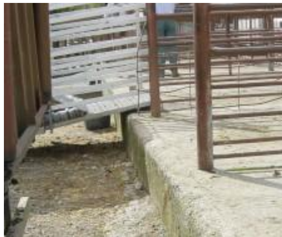
Figure 3: Permanent ramp construction at farm for loading animals (Reference- https://www.hsa.org.uk/facilities/loading-ramps )