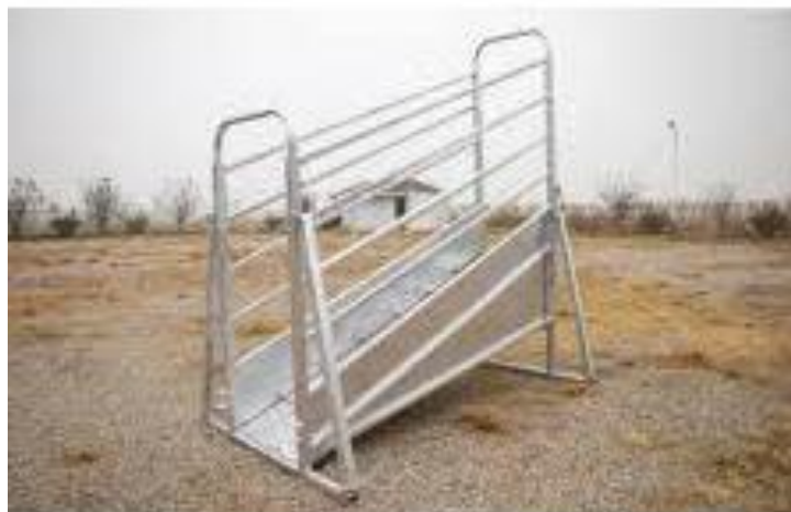
Figure 4: Ramp for unloading the food animals (Reference- https://hanjiangzhao.en.made-in-china.com/product/MNFQEciPZHkW/China-Mobile-Adjustable-Sheep-Unloading-Cattle-Yard-Loading-Ramp.html )