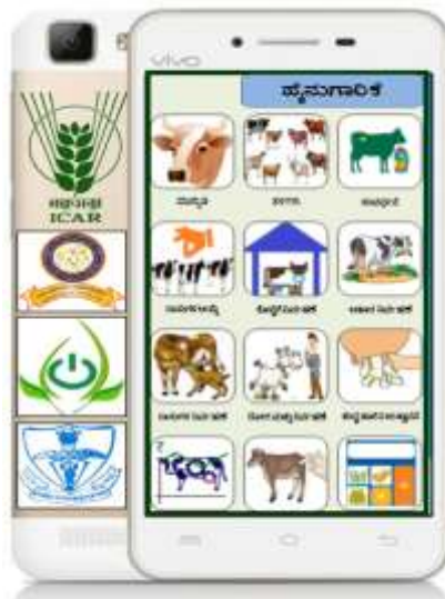
Fig. 2: Dairy mobile app with its icons

dairy animal', 'Housing Management', 'Feeding Management', 'General care and management of calves, milch animal' varieties', 'Diseases', 'Clean milk production', 'Economic dairying', 'Vaccination', 'Feed calculator' and 'Record Keeping'(Fig. 2).