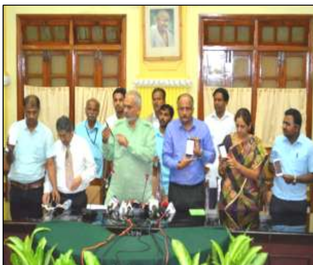
Fig. 3: Dairy App released by Shri. A. Manju, Honourable Minister of Animal Husbandry, Government of Karnataka

By selecting any of icons, farmers can access information in audio format with visual background. The developed information module was named as “Dairy Kannada” and “Dairy English: and was tested among dairy farmers and extension professionals for refinement in the content and quality of the App. This “Dairy Kannada” App was released by Minister of Animal Husbandry, Government of Karnataka (Fig. 3).