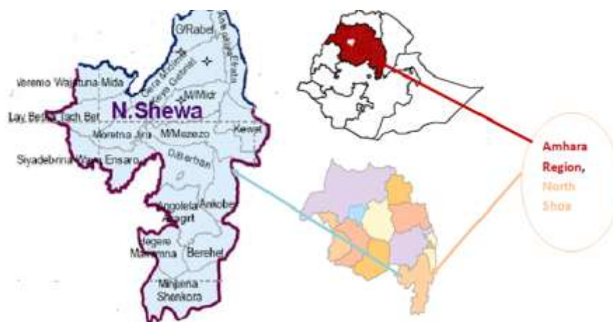
Fig . Study area (left: map of Amhara Region and right: North Shoa with the study areas signaled by+ symbol)

Zemero) with administrative center of Zemero and a total population of 46,219, of whom 22,965 are men and 23,254 women; 2,623 or 5.68% are urban inhabitants.