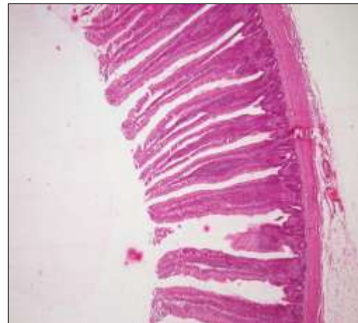
Fig. 2: Morphometry of intestinal villi (Antibiotic supplemented group T 2 )