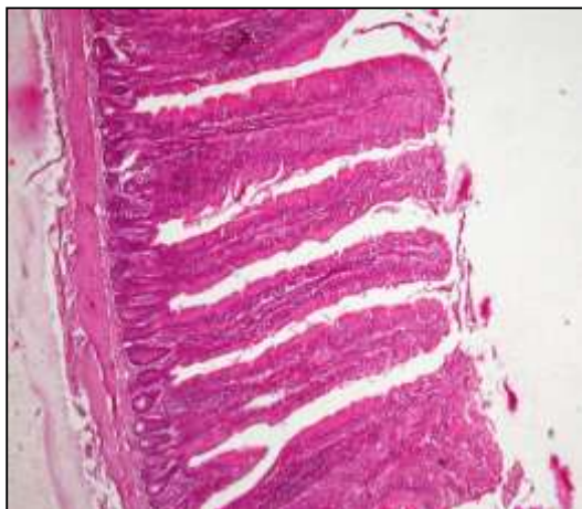
Fig. 5: Morphometry of intestinal villi (0.75% amla supplemented group T 5 )