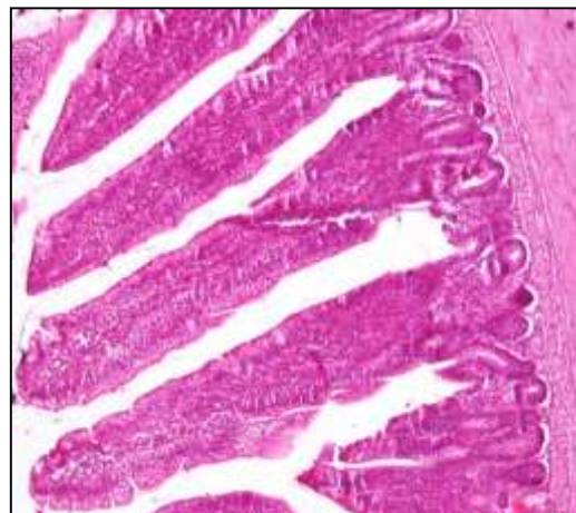
Fig. 6: Morphometry of intestinal villi (1% amla supplemented group T 6 )