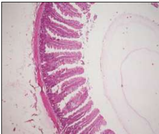
Fig. 3: Morphometry of intestinal villi (0.25% amla supplemented group T 3 )