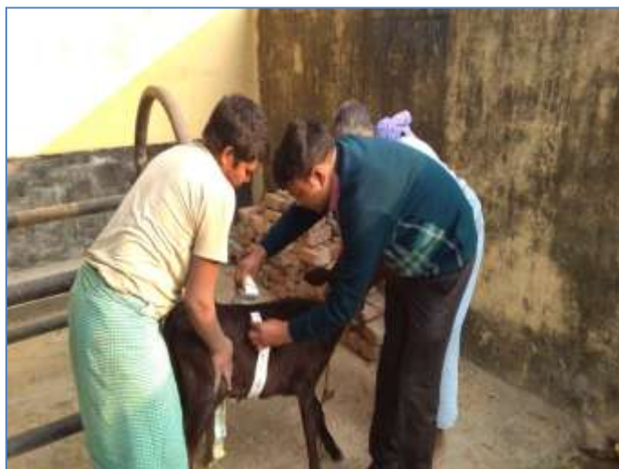
Fig. 2: Measurement of various parameter in calf

Cross bred cow calves, of both sexes upto one and half to two and half month of age, of Naisara Ghazipur were included in the study as shown in Table 1. These selected calves divided into three groups of five each one group as a control in which farmers follow their traditional practice simply feeding of available green fodder and second group of calf feeded with concentrate as per body weight (follows thumb rule of nutrient management) and multivitamin and third group feeded with balance amount of concentrate multivitamin and green fodder berseem after balancing soil nutrient on the basis of soil sample tested presented in figure (Fig. 2).