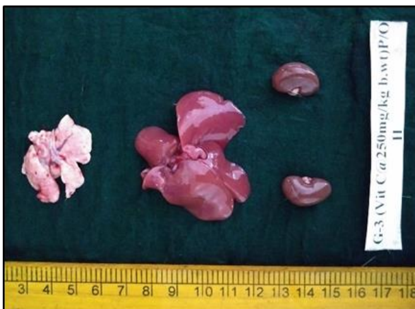
Figure 5: Group 3 rat on 7 th day showing normal appearance of lungs, liver and kidneys.