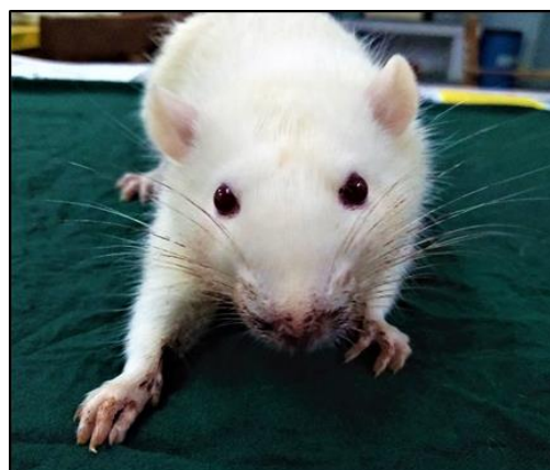
Figure 2: Group 2 rat on 19 th day showing blood staining around nostrils, mouth and on medial surface of fore legs

The clinical signs noticed in the present experiment are in agreement with the earlier findings of Lalruatfela et al. (2014) and Junbo et al. (2017). In the present study, decreased body weights in toxic group were similar to the observations of Reddy et al. (2019). Group 4 rats did not manifest any toxic signs which signify the ameliorative effect of vitamin C over highly toxic PQ.