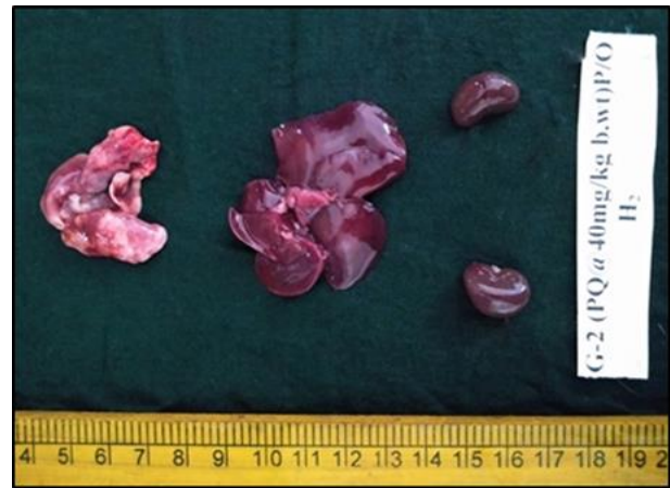
Figure 4: Group 2 rat on 7 th day showing moderate congestion and mild emphysematous areas of lungs, shrunken and moderately congested liver and moderately congested kidneys.