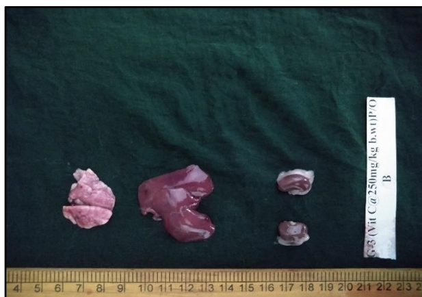
Figure 9: Group 3 rat on 21 st day showing mild emphysema of lungs and normal appearance of liver and kidneys.