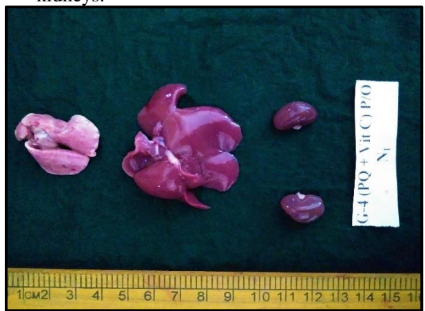
Figure 6: Group 4 rat on 7 th day showing mild emphysema with focal haemorrhagic spots on lungs and mild congestion of liver and kidneys.