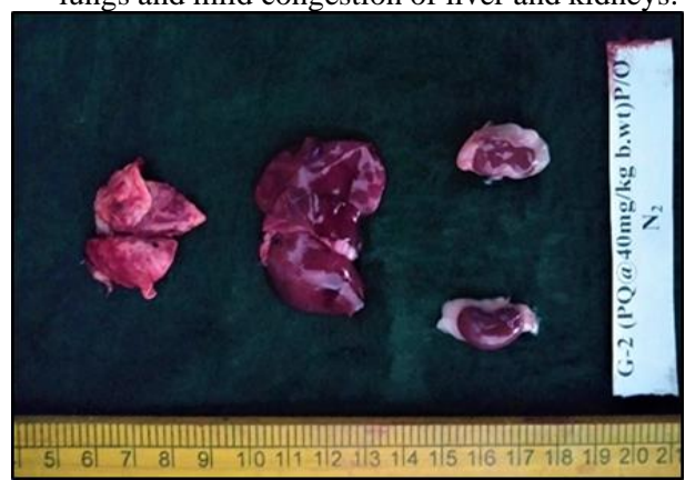
Figure 8: Group 2 rat on 21 st day showing diffuse haemorrhages, severe oedema and congestion of lungs, severely congested liver and kidneys.