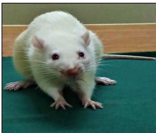
Figure 1: Group 2 rat on 13 th day showing bloody nasal discharges and back arching posture

Anorexia, lethargy, body weight loss, tachypnea, respiratory distress with squeaking sounds, wet rales, piloerection, back arching posture and bloody nasal discharges were observed in group 2 rats during 13 th to 21 st day of experiment whereas other groups (1, 3 and 4) were normal (Fig. 1 and 2). However, no mortalities were recorded during the experimental period.