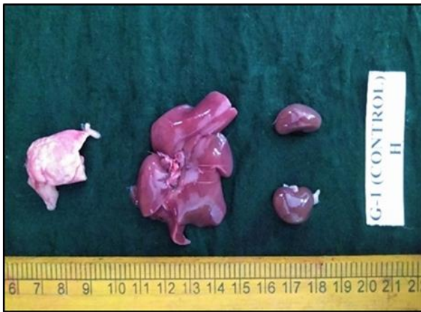
Figure 3: Group 1 rat on 7 th day showing normal appearance of lungs, liver and kidneys.