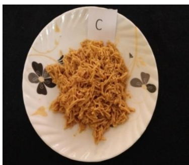
Fig. 3: Cooked noodles enriched with eggs (Wheat flour-based 20%)