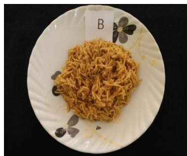
Fig. 2: Cooked noodles enriched with eggs (Wheat flour-based 10%)