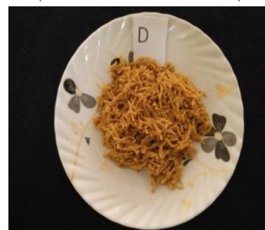
Fig. 4: Cooked noodles enriched with eggs (Wheat flour-based 30%)