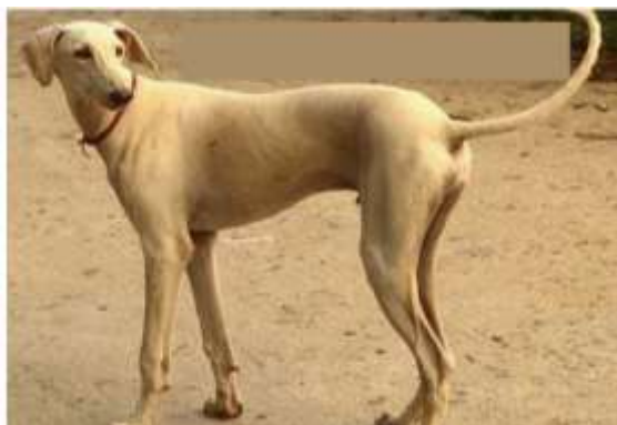
Fig. 1: Photograph of adult Chippiparai dog