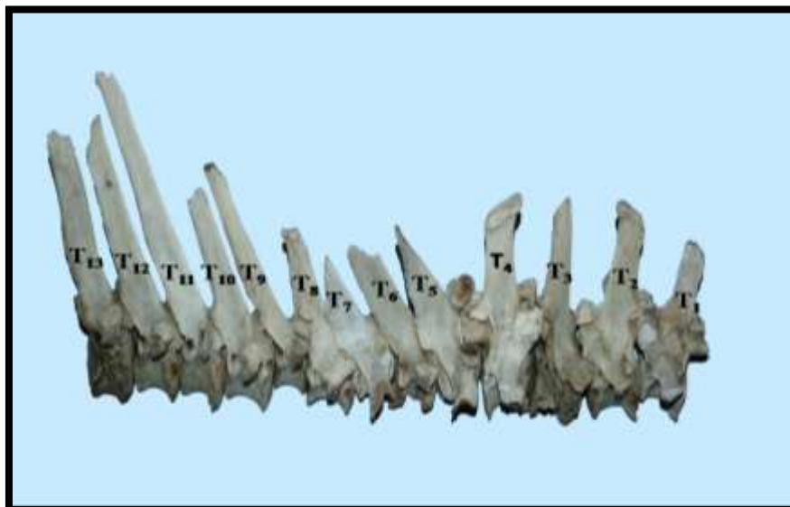
Fig. 1: Lateral view of thoracic vertebrae (T 1 – T 13 ) of adult female Blue bull ( Boselaphus tragocamelus )